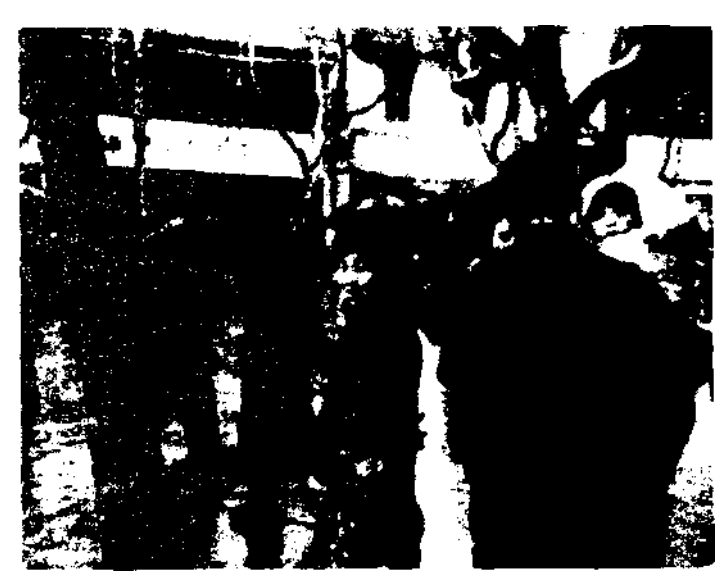
Figure 1.1. On a Bĕijīng street

6. Learn the pronunciation and location of any five cities and five provinces of China found on the maps on pages 90-81.